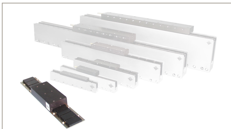
The BLMF is shown with Aerotech's linear motor line.

Offering high peak forces in its standard configuration, BLMF motors are available with higher-power magnets that can be used to increase output force.